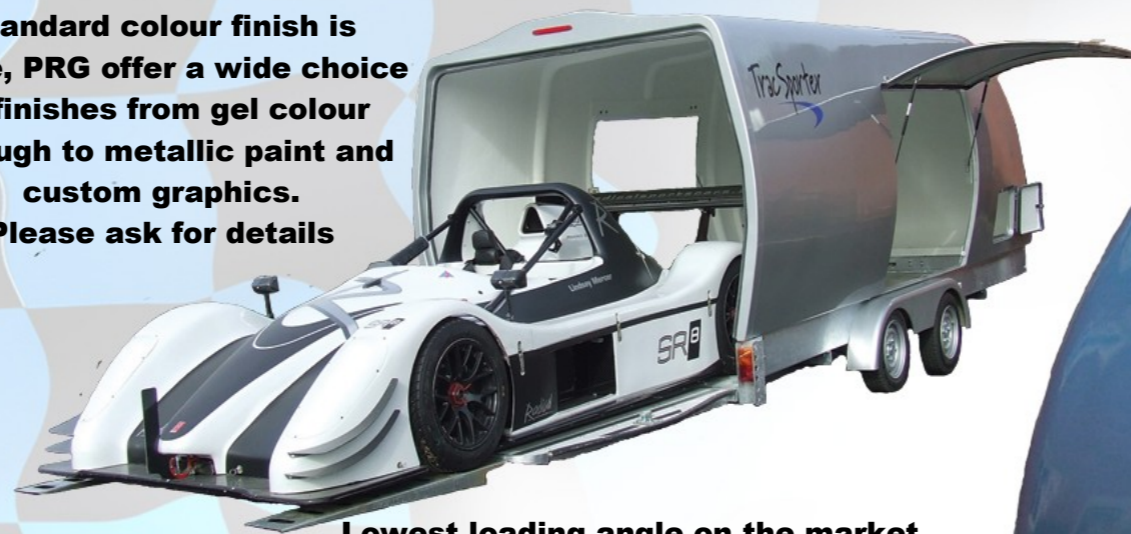
Lowest loading angle on the market

Standard colour finish is white, PRG offer a wide choice in finishes from gel colour through to metallic paint and custom graphics. Please ask for details