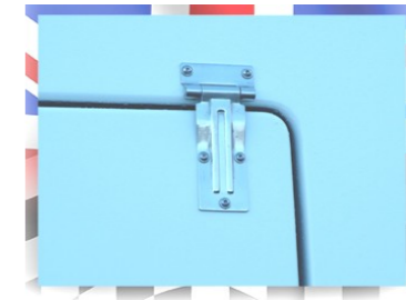
Gull-wing doors fitted as standard on the XW model, designed with integral moulded door frame to give a sealed professional door opening.