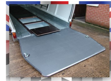
Flat level floor with the latest anti-slip rear door panel to aid loading with maximum grip