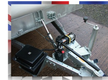
Hydraulic tilt bed operation with dual action hand pump, allowing the shallowest loading angles on the market. We also have an electric tilt bed option.