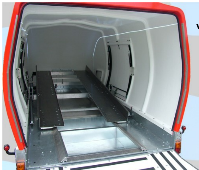
Hydraulic 2nd deck within TracSporter

Optional independent shock absorbers to give a softer ride, when fitted in conjunction with the Winterhoff safety coupling you can tow at 120KPH through several European countries