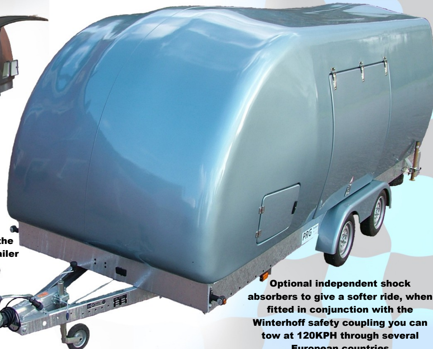
Winterhoff safety coupling for the ultimate connection between trailer and tow vehicle

Optional independent shock absorbers to give a softer ride, when fitted in conjunction with the Winterhoff safety coupling you can tow at 120KPH through several European countries