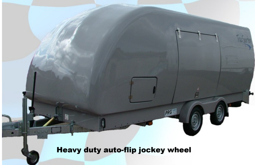
Heavy duty auto-flip jockey wheel